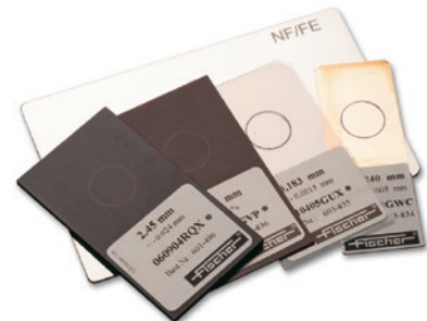
As a DAkks-accredited company, FISCHER offers a variety of calibration standards

A USB port is available for transferring the data to a PC or laptop, where, using the FISCHER DataCenter software, the values are quickly imported and easy-to-read reports generated.